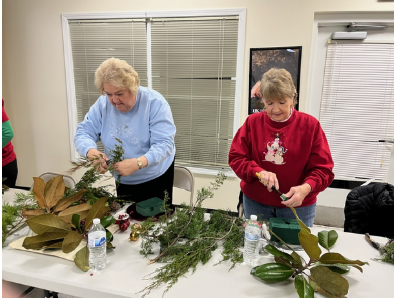
Photos: Participants choose their greenery to use in their centerpiece

Everyone made their own centerpieces and were very excited about the new skill they had successfully mastered. Not only was I able to reach new audiences that I had not had a chance to meet before, but I also had requests to hold the same program in years to come!